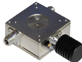
JAG-IC-132-1-30 Shown with a 30W load

JAG isolators and circulators offer superior performance in a compact rugged package. Careful temperature compensation and top quality components ensure high isolation with very low insertion loss over their full operating temperature range, and offer a high degree of RF and magnetic stability. Circulators are supplied without loads. Isolators come equipped with a variety of load terminations. JAG isolators and circulators are available factory-tuned in the 70, 150, 450 and 800-960 MHz frequency bands. Field tunable isolators are available for the 138-174 and 406-430 or 450-470 MHz bands.